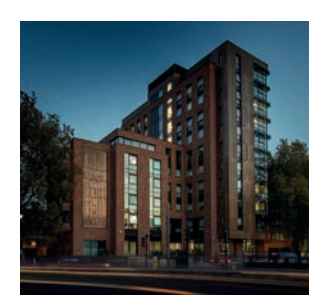
Print Hall East Residential Village

Catered and self-catered 2.2 miles to campus From £152 per week