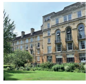
Manor Hall West Residential Village

Postgraduate residence 170 places Self-catered 1.3 miles to campus From £217 per week